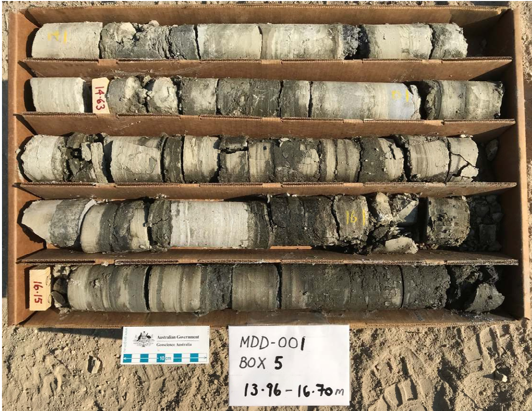
Figure 3 – Drill core from hole MDD-001 at McDermitt showing an example of the flat-lying sedimentary package intersected in recent drilling, and excellent core recovery.