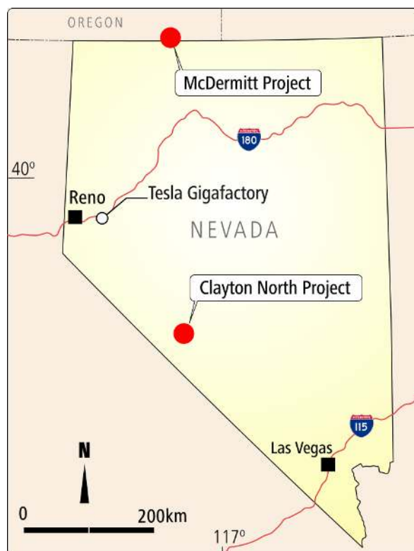
Figure 1 – Location of Jindalee's US Lithium projects.