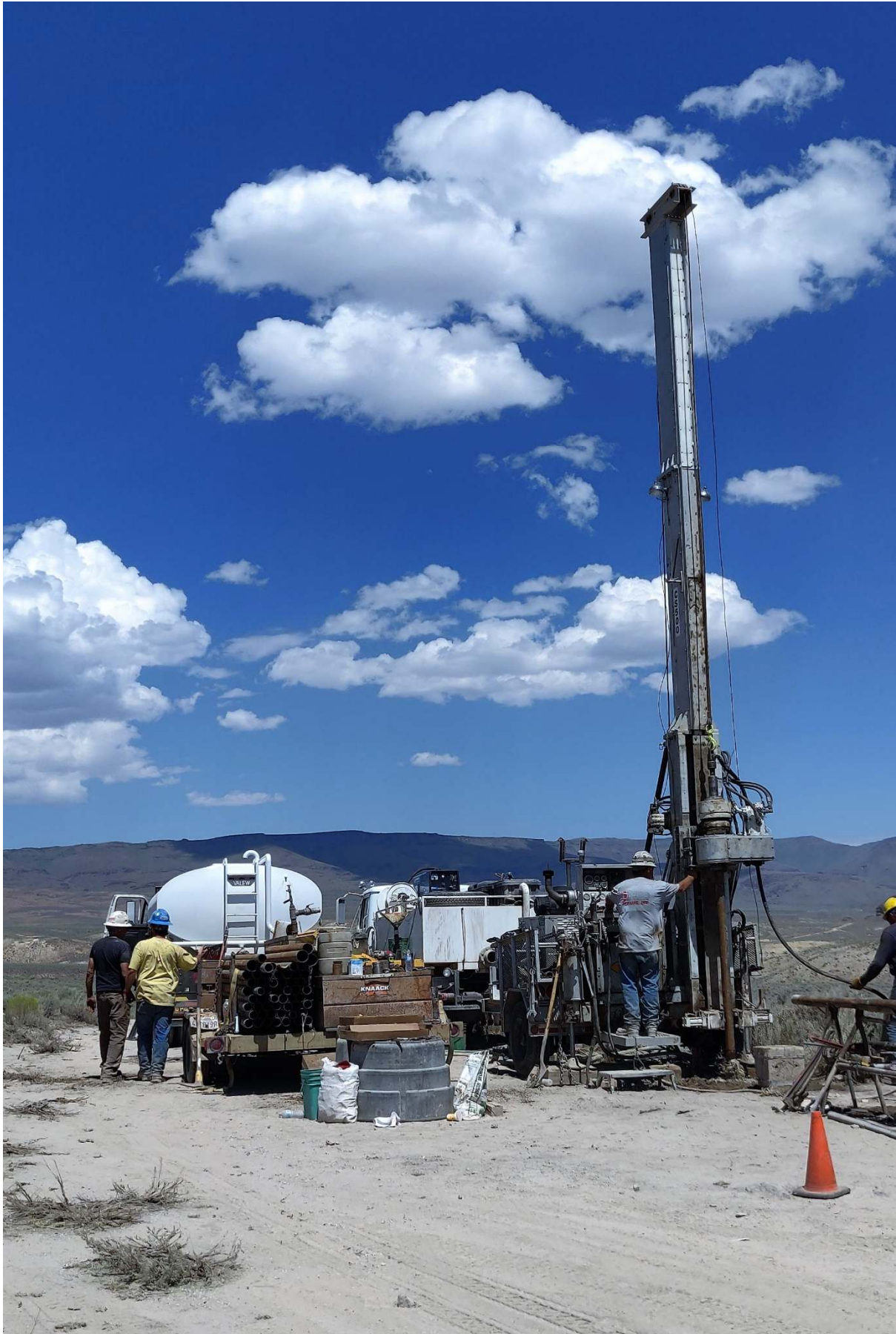
Figure 2 – Drilling the first hole (MDD-05) for 2019 at McDermitt.