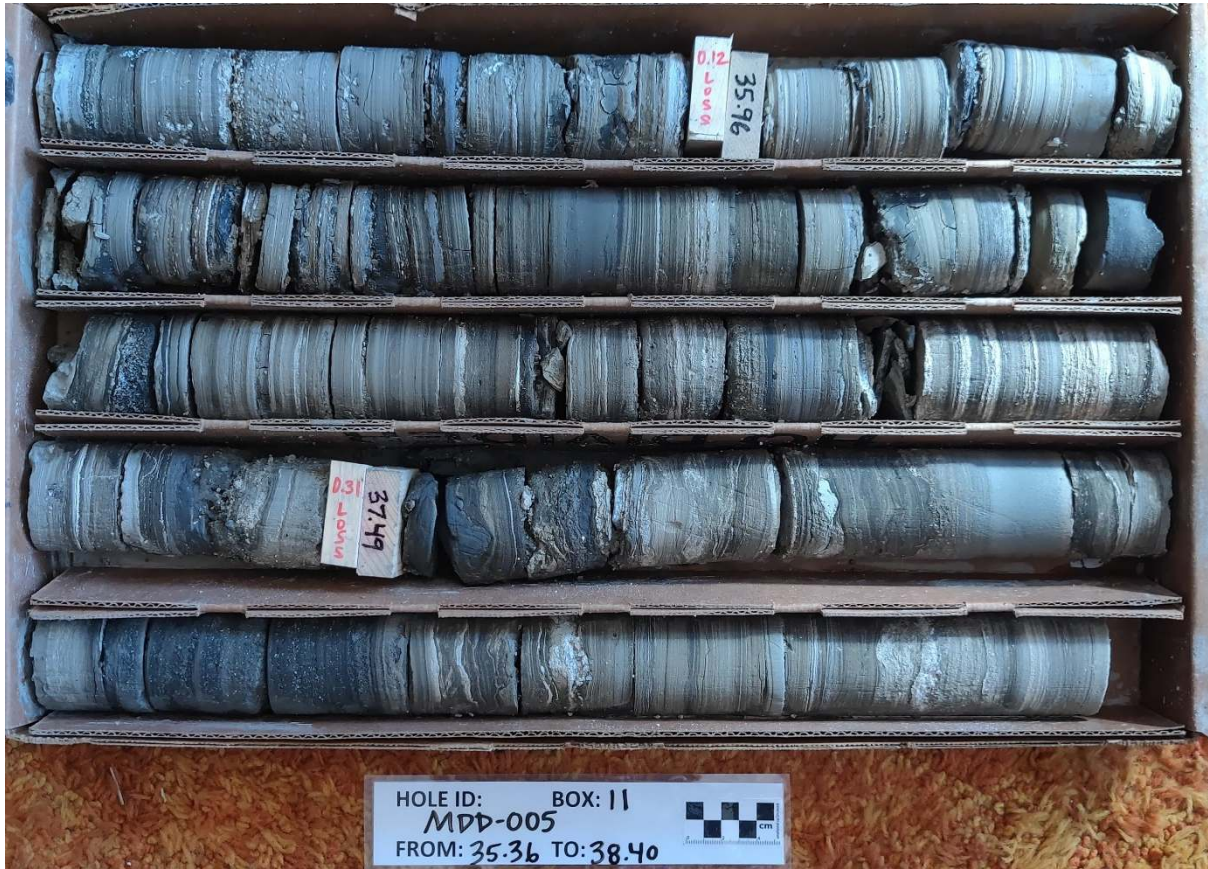
Figure 4 – Example of core retrieved from the current hole in progress at McDermitt, showing excellent recovery.