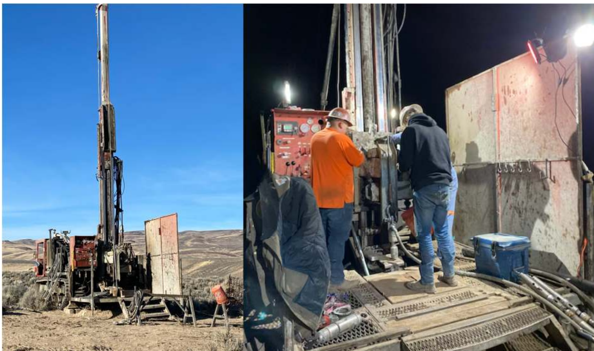
Figure 1. Diamond drill rig at McDermitt.

Jindalee Resources Limited ( Jindalee , the Company ) is pleased to announce drilling has commenced at its 100% owned McDermitt project located in Oregon, US (Figure 1). The program is designed to infill and extend the current Mineral Resource announced in April 2021 of 1.43Bt @ 1,320ppm lithium (at a 1,000ppm lithium cut-off) 1 . A diamond drill rig has commenced drilling, with a Reverse Circulation (RC) rig expected to arrive on-site this week.