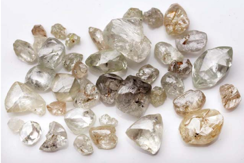
Figure 4 - Persephone – Total 5.16 carats (largest diamond 0.67 carats)