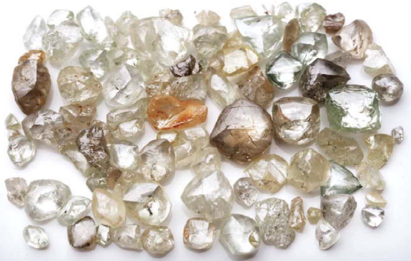
Figure 3 - Athena – Total of 13.78 carats (largest diamond 0.79 carats)

See below photo's (Figure 3 & Figure 4) of diamonds recovered from the Project in 2005 3